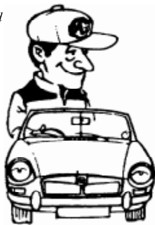
tail lights, front

The ATF-Acetone mix was a "home brew" mix of 50-50 automatic transmission fluid and acetone. Note the "home brew" was better than any commercial product in this one particular test. Our local machinist group mixed up a batch and we all now use it with equally good results. Note also that "Liquid Wrench" is about as good as "Kroil" for about 20% of the price. Your experience may vary, etc., etc.