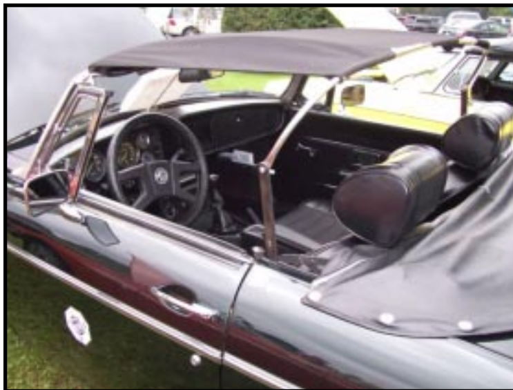
KILR BE is ready for the summer drive!