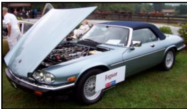
Blue Kitty on display

There were only 2 Jags there, our BK and a 1973 XKE V-12 hard-