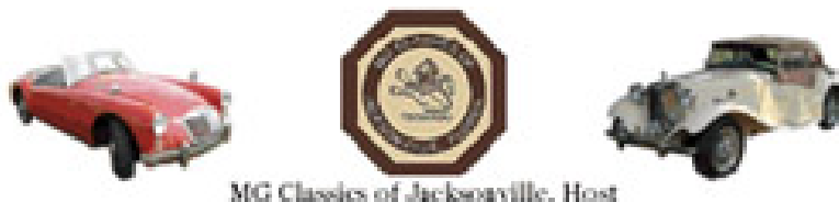
MG Classics of Jacksonville, Host

Come join us on beautiful Jekyll Island for the forty first MG Gathering Of the Faithful - South!