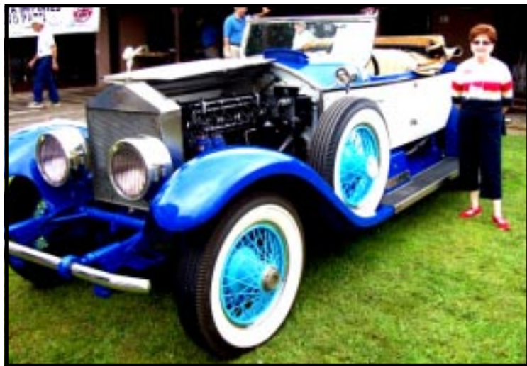
Mary Ann & 1927 Rolls

It was a dark and stormy morning..... Saturday morning dawned gray, foggy, and still raining. It rained on-and-off from 6 AM to 10 AM, the display start time. I washed the bug splats and road film off of BK about 7 AM - then had to dry her off 4 more times before 10 AM, and then one more time around 10:30 after yet another passing rainshower. After that the rain let up, and the sun even peeked out a few times after lunchtime. Great show - many Brit marquees present - including some rare and unusual one like Rolls Royce, Morgan, and Riley. Please see all the pictures we took. Joe will include some of them with this newsletter article, I'm sure, and hopefully Vera will post them at the BBMG web site.