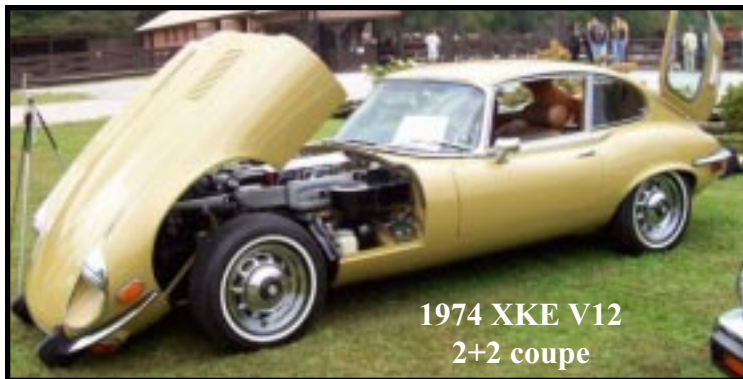
1974 XKE V12 2+2 coupe

top 4-seater. The threat of rain made us keep the top up on BK - too bad, she looks and shows best (and would have got more votes!!!) with her top down and the hood cover in place. One other XKE was supposed to be there, but he broke down 10 miles from Dillard and had to be towed to a garage.