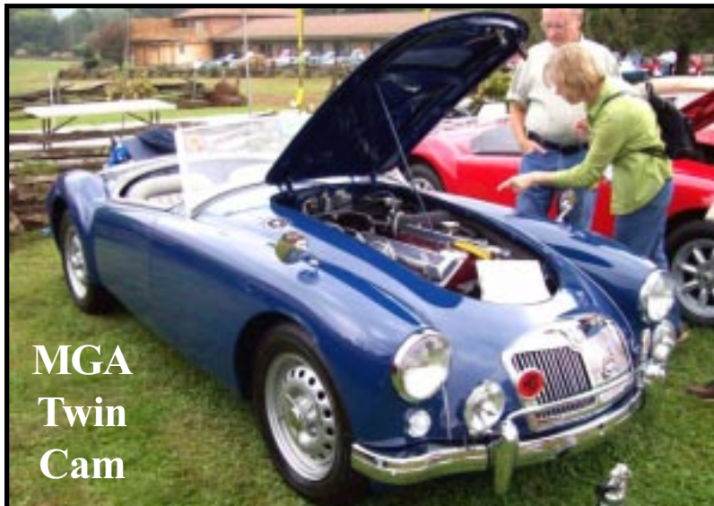
MGA Twin Cam