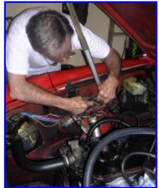
Under the hood like all MG owners!

I'm standing there next to the car still undaunted and I run my hands over the body. Yep, bumps in all the places you expect bumps. Let's see now, she was reluctant to start