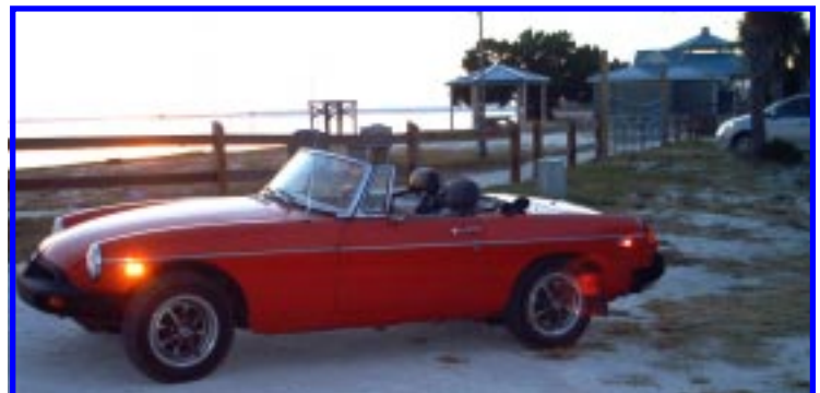
Sunseting on Pumpkin

So with a wink and a nod, the owner and I come to an agreement. We swapped title for money and I became the proud owner of a bright orange, 1977 MGB. Iknew I would have to tow her home but I didn't care. Visions of my youth flashed before my eyes, carefree driving down long narrow winding highways with nothing but the radio for company. I had forgotten that the MG of my youth was the way it was because I never had enough money to fix things. But how could this beautiful thing ever want to get into my wallet. That's the story for next time.